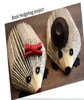
Book Hedgehog project